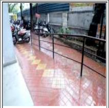
Ramp Lat:18.53472 Lang:73.88094